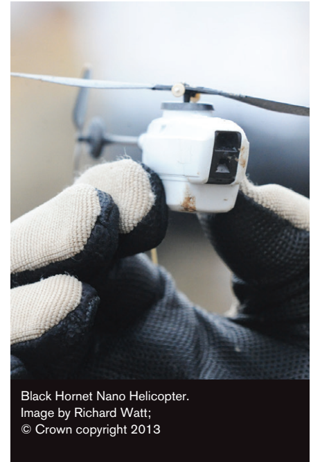
Black Hornet Nano Helicopter.