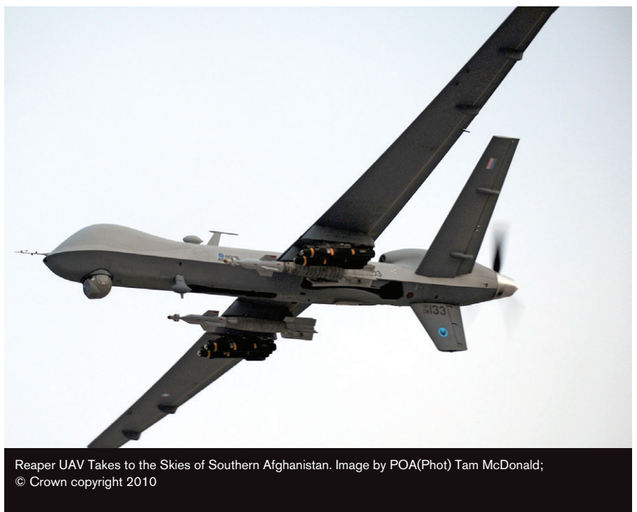
Reaper UAV Takes to the Skies of Southern Afghanistan.

The first challenge is in gaining wider public understanding and acceptance of the soundness of the ethical and legal frameworks within which the RAF will operate its armed RPA, including new systems as they become available. We reject the argument of those that would single out RPA technology as novel and therefore intrinsically problematic, a position driven by what many perceive as illegal US use of RPA to kill leading figures of al-Qaeda and associated jihadist groups and of the civilian casualties that have resulted. UK policy regulating the use of armed RPA in Afghanistan already meets the highest standards of distinction and proportionality under international humanitarian law, and has played a vital role in force protection. We also reject the