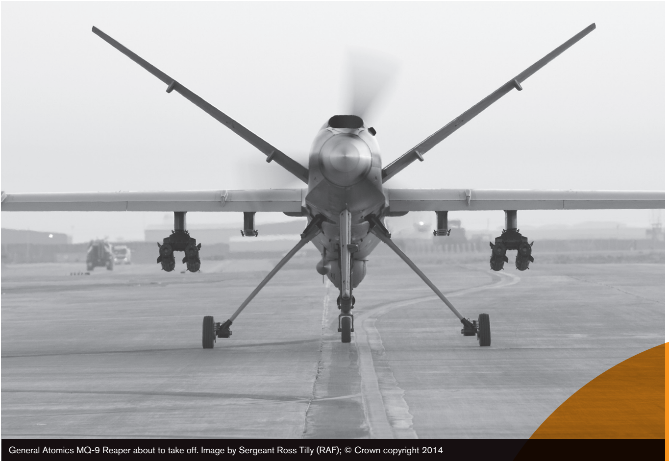
General Atomics MQ-9 Reaper about to take off.