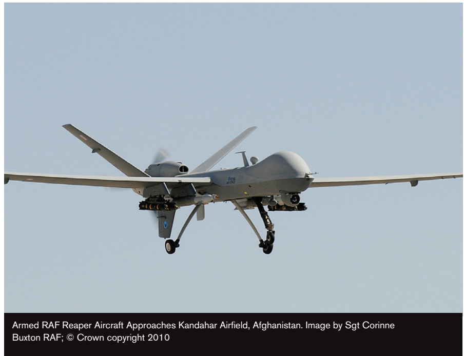
Armed RAF Reaper Aircraft Approaches Kandahar Airfield, Afghanistan.