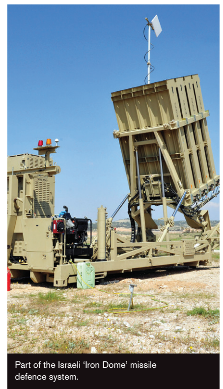
Part of the Israeli 'Iron Dome' missile defence system.