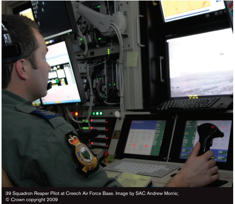
39 Squadron Reaper Pilot at Creech Air Force Base.