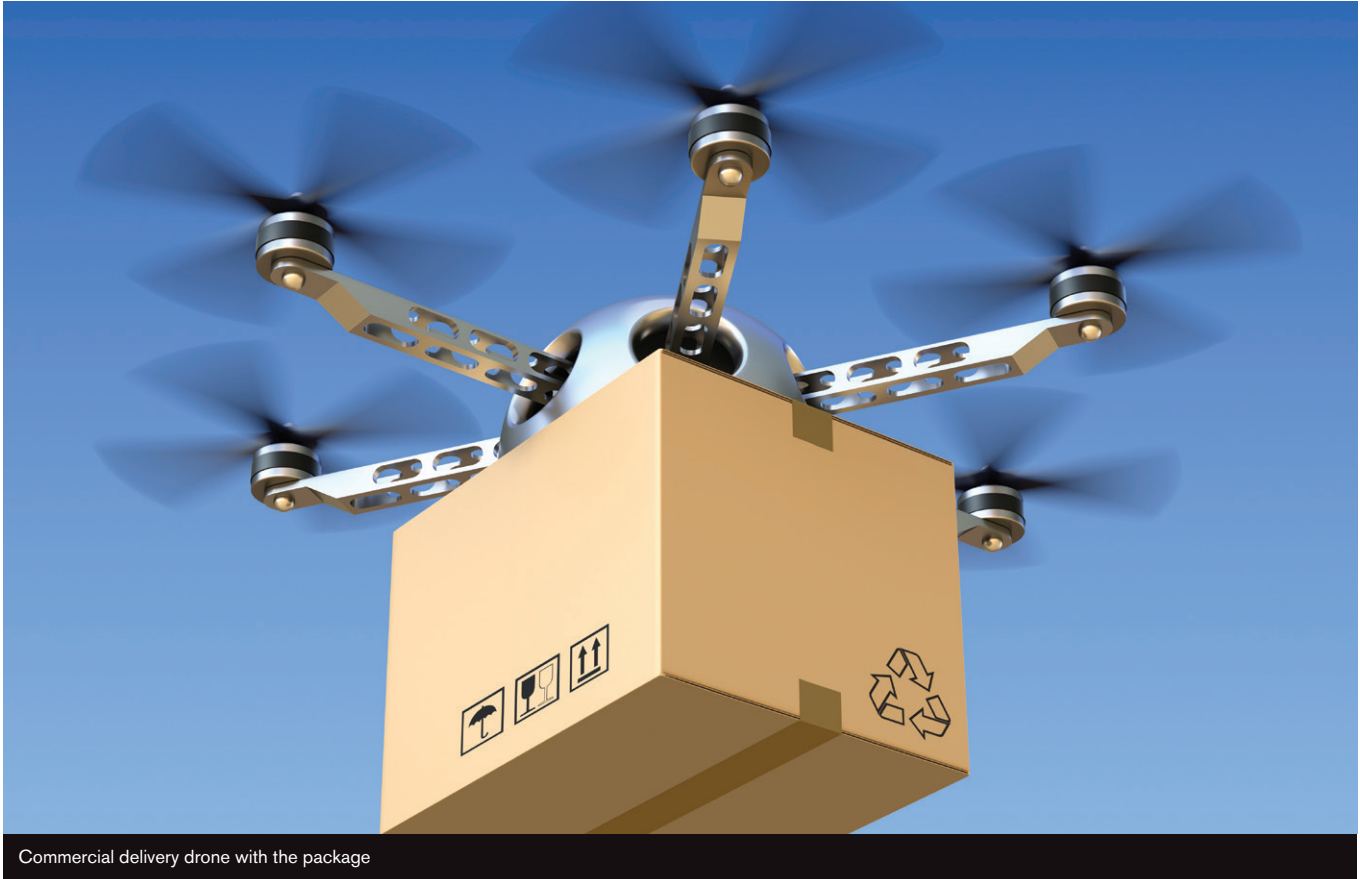
Commercial delivery drone with the package