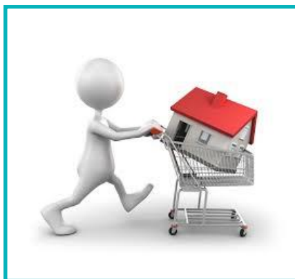
Buying a house